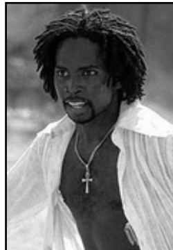
Mercutio, from the 1996 film