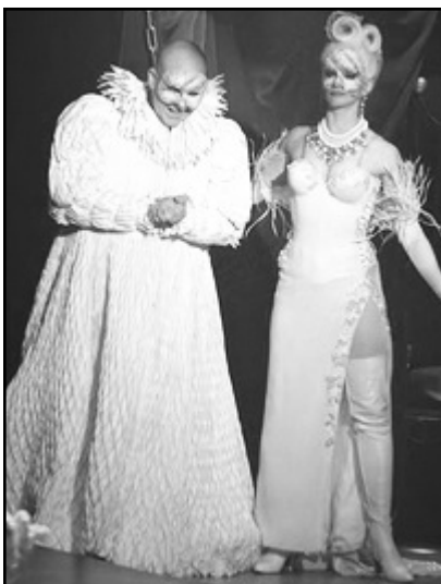
Lord and Lady Capulet, from a German musical production