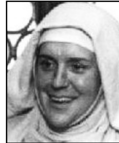
Nurse, from the 1968 film