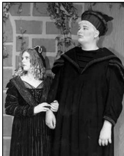
Lady and Lord Montague, from a production by the California School for the Deaf