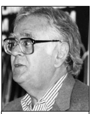
Joe Slovo is the commander of the ANC and South Africa Communist Party's armed resistance.