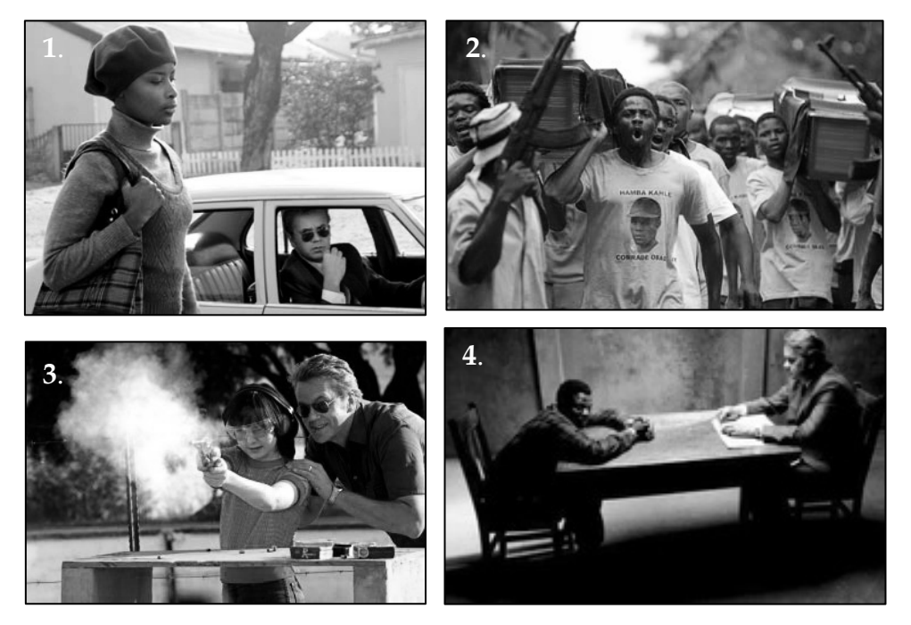
Exercise B: Describe what is happening in these pictures.

Exercise A: Put these pictures in order.